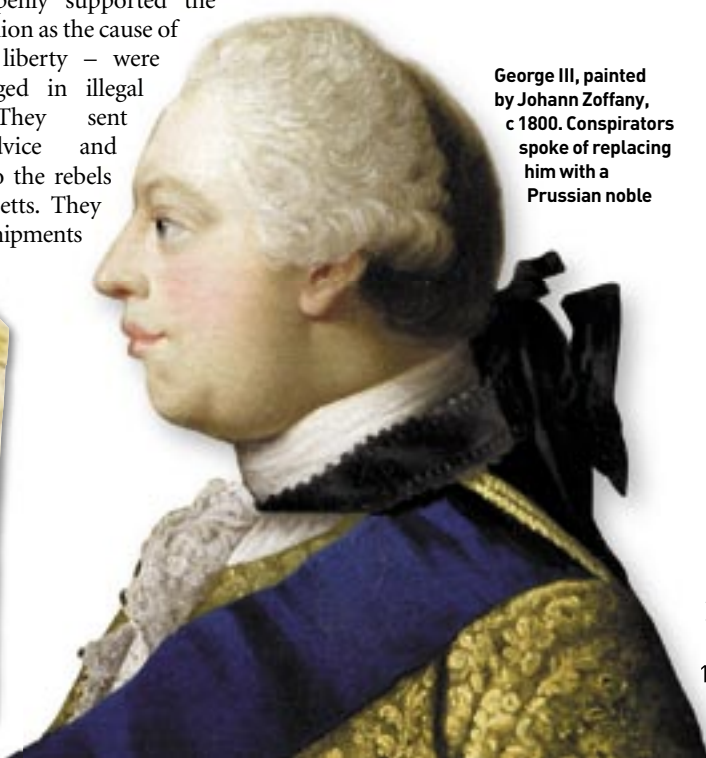
George III, painted by Johann Zoffany, c 1800. Conspirators spoke of replacing him with a Prussian noble

Edmund Burke , British politician, reformer, and political theorist, to the Marquess of Rockingham, 4 August 1775