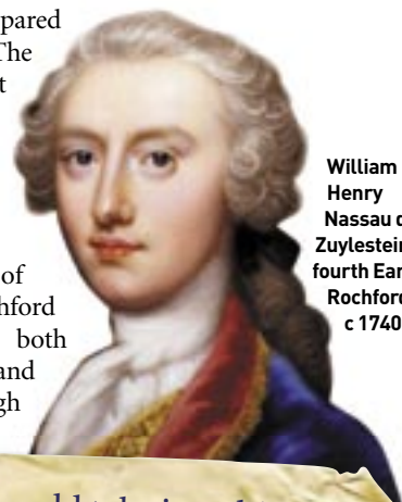
William Henry Nassau de Zuylestein , the fourth Earl of Rochford, c 1740-45