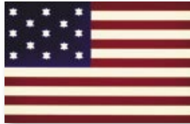
An early stars and stripes with 13 stars, c 1775. Over 1,000 Americans lived in London at the time