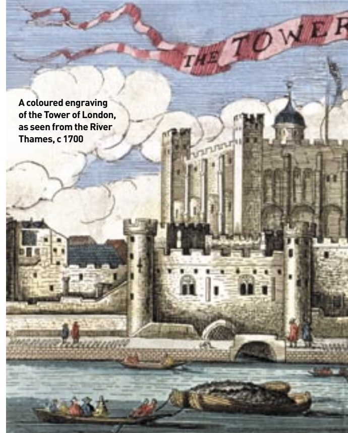
A coloured engraving of the Tower of London, as seen from the River Thames, c 1700