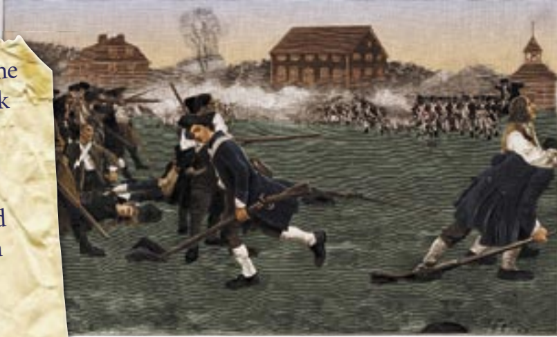
A print depicting 'The Fight on Lexington Common', the first military engagement of the American War of Independence, Massachusetts, 19 April 1775