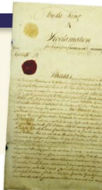
George III's proclamation for the suppression of rebellion and sedition in the colonies, 1775

In the 20th century, legislation was passed that set out in greater detail the rules by which an individual may be detained. Nevertheless, habeas corpus remains today a symbol of fundamental liberties. Whether recent anti-terror legislation, allowing a suspected terrorist to be detained without charge for 28 days, is an infringement of the right to habeas corpus remains a matter of controversy.